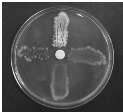
Fig. 2 Response of aerial mycelium-deficient mutants to pamamycin.

Presence of possible intermediates of pamamycin, PM-ketone ( 2 ), hydroxy acids K ( 3 ), L ( 4 ) and S ( 5 ), were investigated in the cultured materials of two mutants, strains 188 and 202, and amounts of these compounds were compared with those of the wild type strain (Fig. 3). In